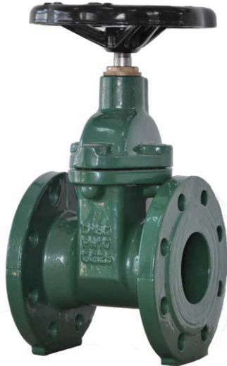
Fig. 3246 (DIN F4) 3247 (DIN F5)