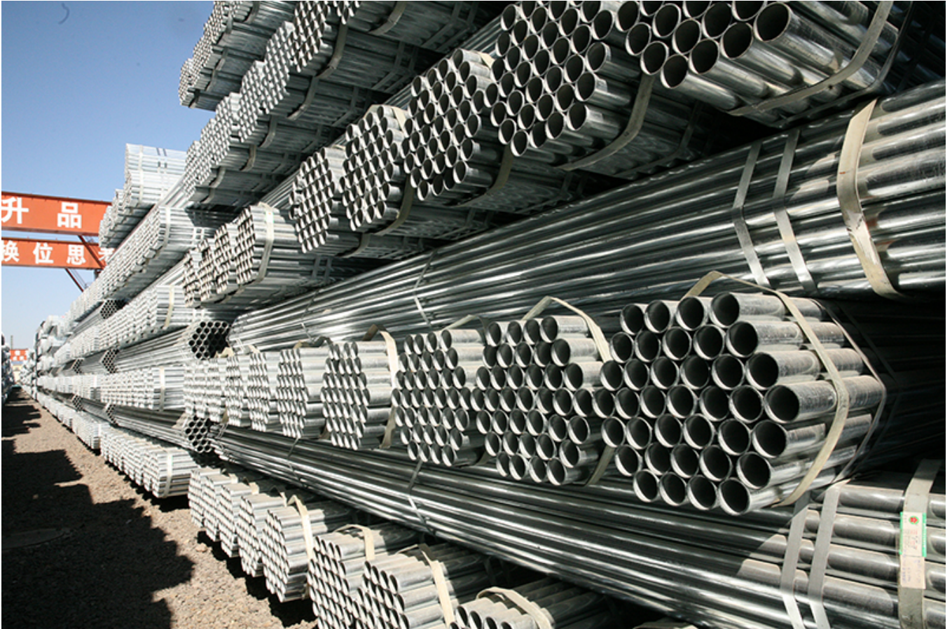
Mild Steel Round Hollow Section Sch40 Gi Pipe Grooved ends