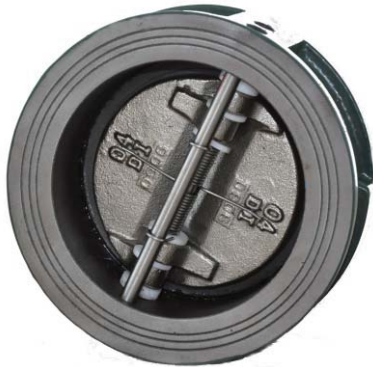
Fig. 5306 (DIN3202) 5307 (API 594)