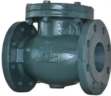
Fig. 5101(PN16/Class 125) 5102(Class 250)

Flange Type Swing Check Valve-BS/MSS Metal Seated